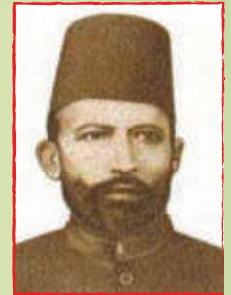
Hakim Ajmal Khan